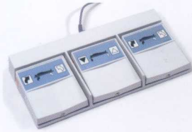
Foot Control for all Movements