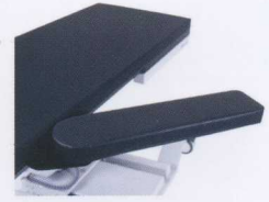
Patient Arm Board and Pad