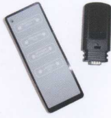
Wireless Hand Control